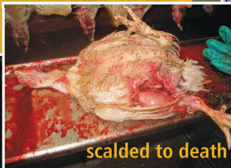
scalded to death