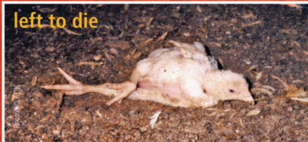
left to die